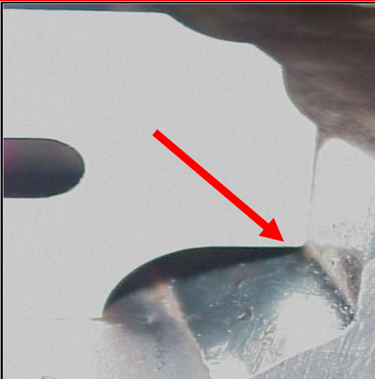
Weld toe touches fillet weld gage = Acceptable