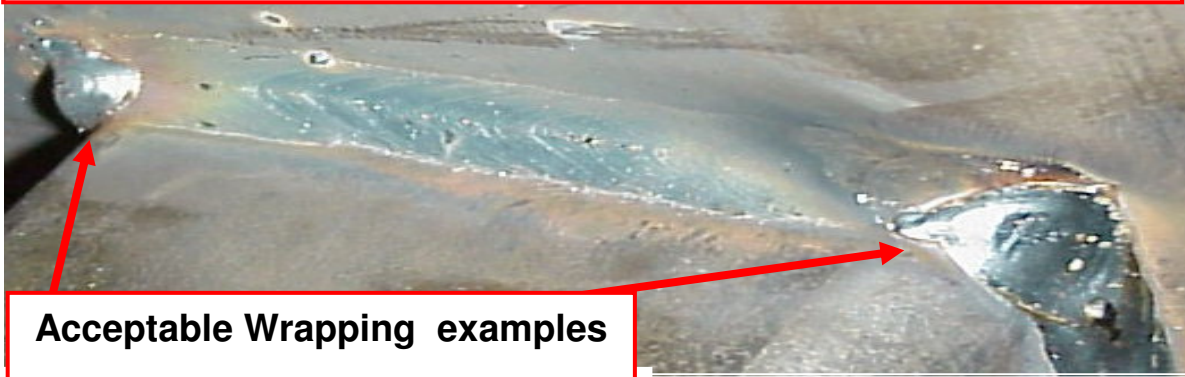
Acceptable Wrapping examples

Is the act of tying the welds together completely. Complete except as shown on print