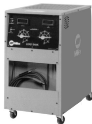
Miller Load Bank #902 804

A welding arc is often referred to as a dynamic load, which simply means it is a changing load. Therefore, do not calibrate meters while welding. We strongly recommend using a resistive (constant) load. Both Miller Load Banks are excellent examples of resistive loads. The LBP-350 Portable Load Bank was specifically designed to help you calibrate meters in the field. (It weighs only 46 pounds.)