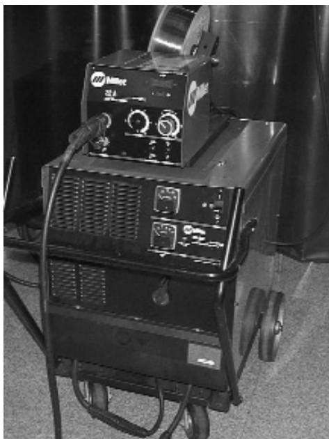
CP-302 Power Source

We'll cover more on calibration in future TechLines, but we'd like your input as to what issues about calibration concern you. Why not drop us a line on our fax machine? Contact us at: FAX 920-735-4013. Let us know what you think about this calibration information so far, and what else we can cover that would be of value to you. Thanks!