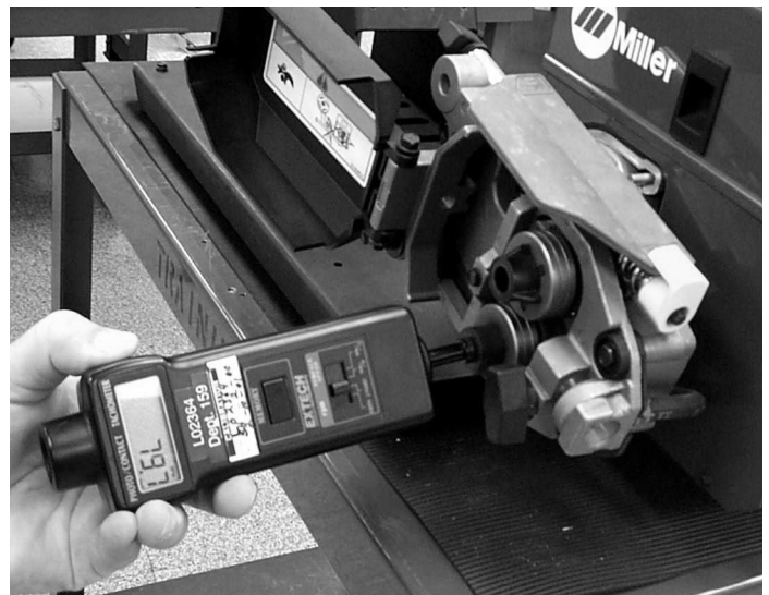
To measure inches per minute, the technician is holding a digital tachometer to the center of a drive roll on the Miller 60 Series wire feeder.

The next step in this Certification Procedure is to fill out the Certificate of Calibration (see example #3 on insert). Then add a sticker to the Wire Feeder, make yourself a copy, and you're done!