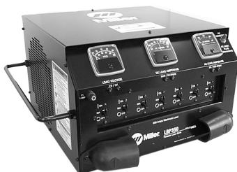
LBP-350 Portable Load Bank #043 329