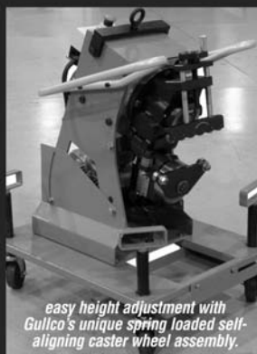
easy height adjustment with Gullco's unique spring loaded self-aligning caster wheel assembly.